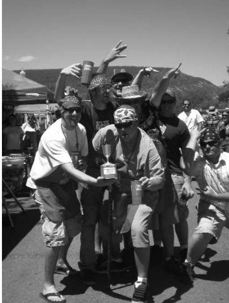
Two-time winner "The Smoking Armadillos" have promised they will return to defend their title in 2009!

If you are interested in reserving a space for your 2009 Men who Grill team, please email members@wrc-durango.org or call Liz at 247-1242.